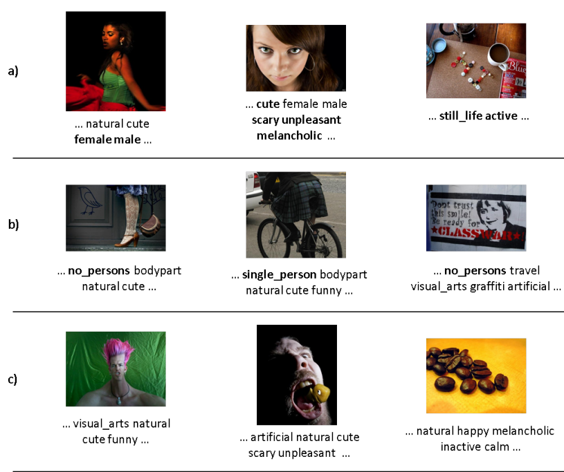
Fig. 1. Trainset labeling errors: a) logical nonsense, b) annotation inconsistency, c) concept overuse.

Each error type is illustrated by a few examples in Figure 1.