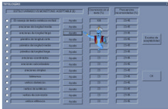
Figure 3. An animated agent explains the analysis results to the user.