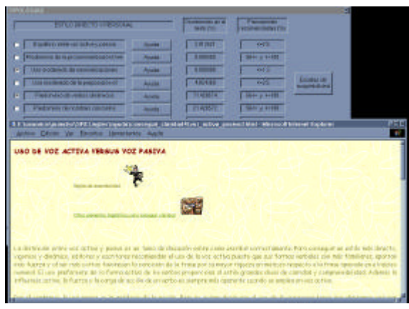
Figure 2. An HTML page that instructs on the use of the passive voice.

The rule + adjective <Adject-0> matches adjectives that are not included in the Adject-0 rule file.