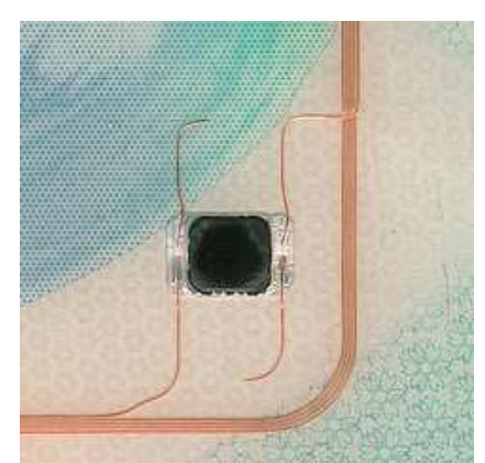
Fig. 1: Contactless chip and antenna from British passports.

communication layer is based on classical smart card protocol ISO 7816-4 (i.e., commands like SELECT AID, SELECT FILE and READ BINARY are used).