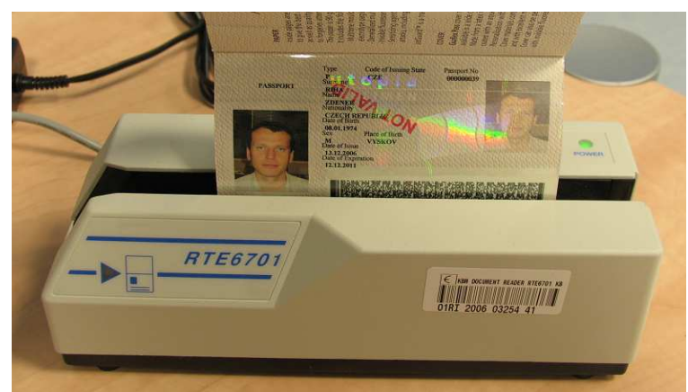
Fig. 2: Scanning of the machine-readable zone data.

We can distinguish two types of brute-force attack. Either the complete (successful) communication is eavesdropped and we try to decrypt it or we try to authenticate against the chip and then communicate with it. When eavesdropping the communication, we can store the encrypted data and then perform an off-line analysis. If the whole communication has been eavesdropped, we can eventually obtain all transmitted data. The disadvantage is the difficulty of eavesdropping of the communication (i.e., the communication must actually be in progress and we must be able to eavesdrop on it).